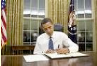
President Barack Obama